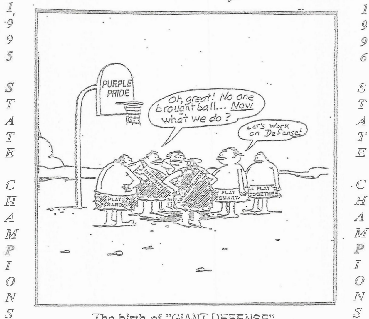
The birth of "GIANT DEFENSE"

ACHIEVING SUCCESS WHILE STRIVING FOR EXCELLENT